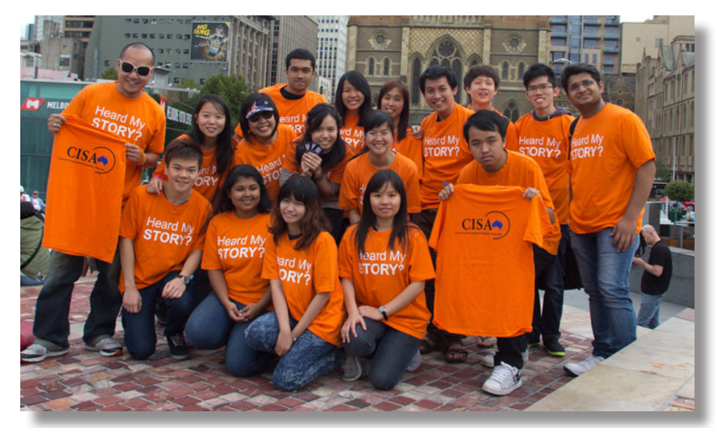
Students share their stories as part of the Council of International Students Australia's (CISA) 'I am not an Australian, but I have an Australian story' project (see right).

IEAA continues its lobbying efforts to ensure the key recommendations are implemented.